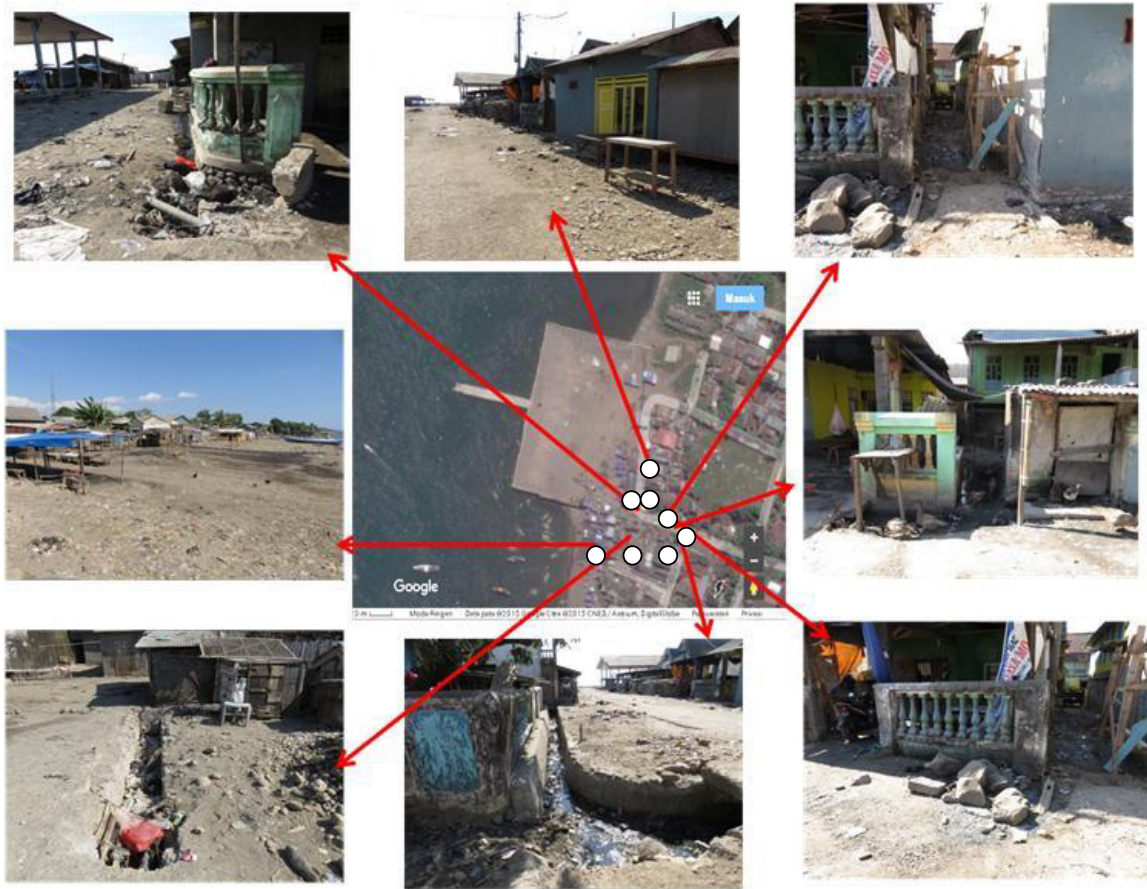
Fig. 3. Sanitation System in The Environment Beba TPI

Based on the results of field observations of the environmental sanitation condition in TPI beba, as follows :