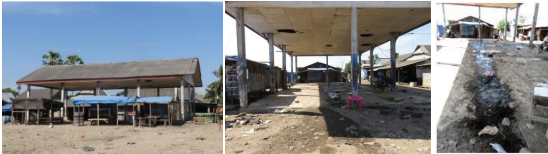
Fig. 2. Beba TPI Building

The condition of the buildings are open without walls. Measures about 8 x 12 m. There is no drainage cannel and water tanks for washing fish, other than that there is no garbage dump in the TPI area. The lower floor of the central part of TPI building, making dirty water always inundated in that area.