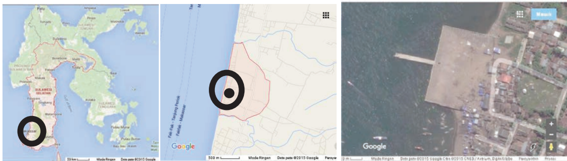
South Sulawesi, Tamasaju Distrik, and Beba TPI Fig. 1. Location of Beba TPI.