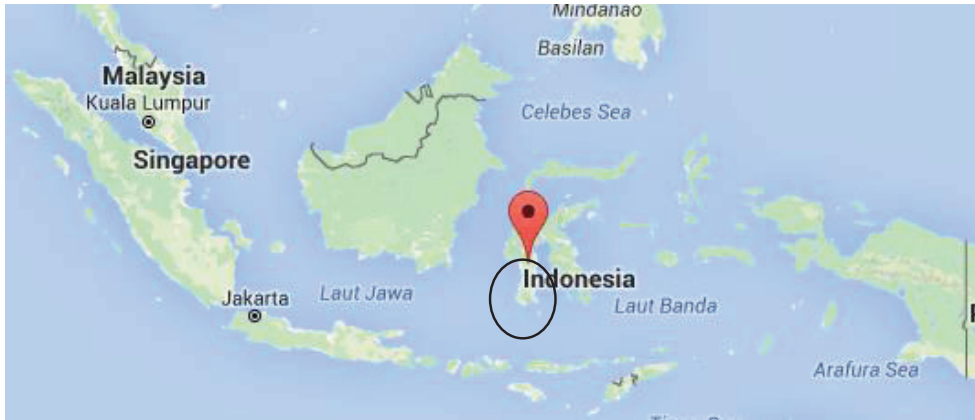
Map of Indonesia